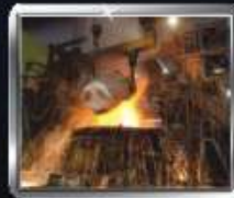
SHUDHATA KA WADA