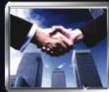
COMMITTED TO SERVE QUALITY